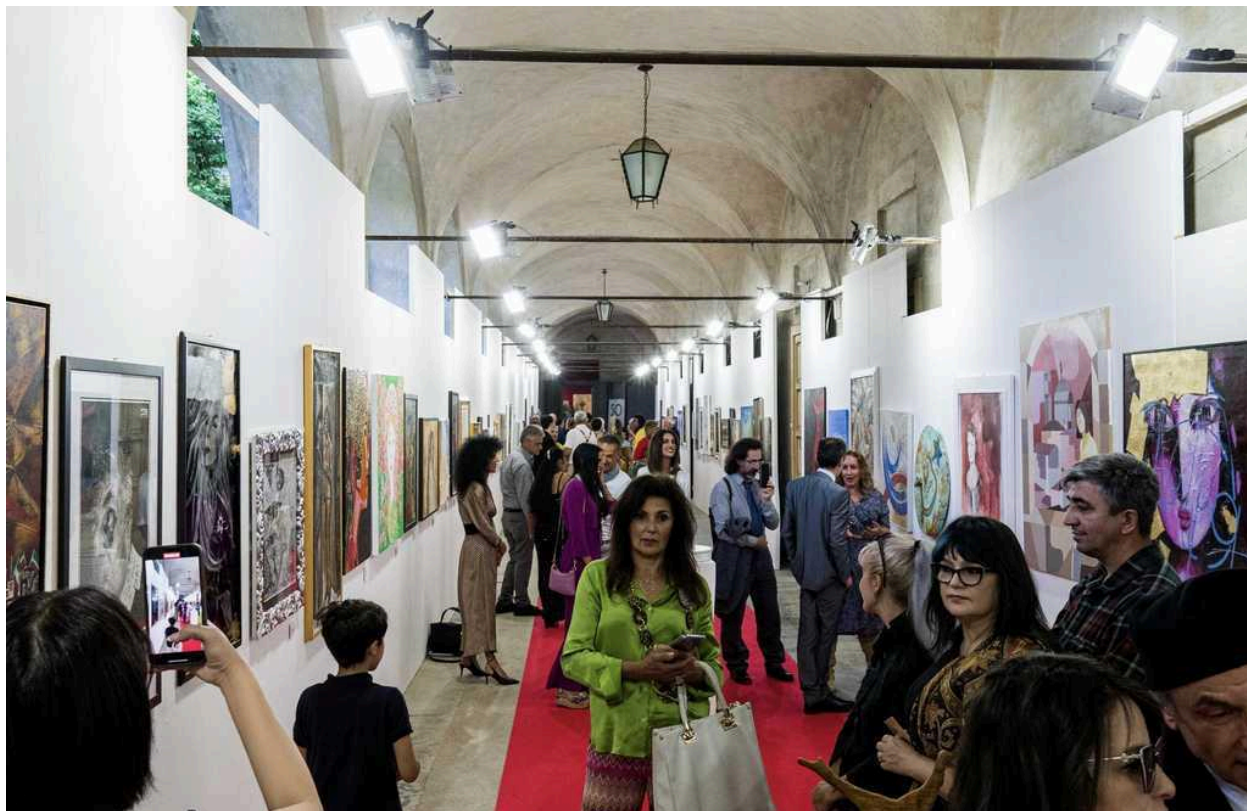
Visitors at the Gonzaga Museum exhibition. Photo and text provided by Liu Liuchengxi.