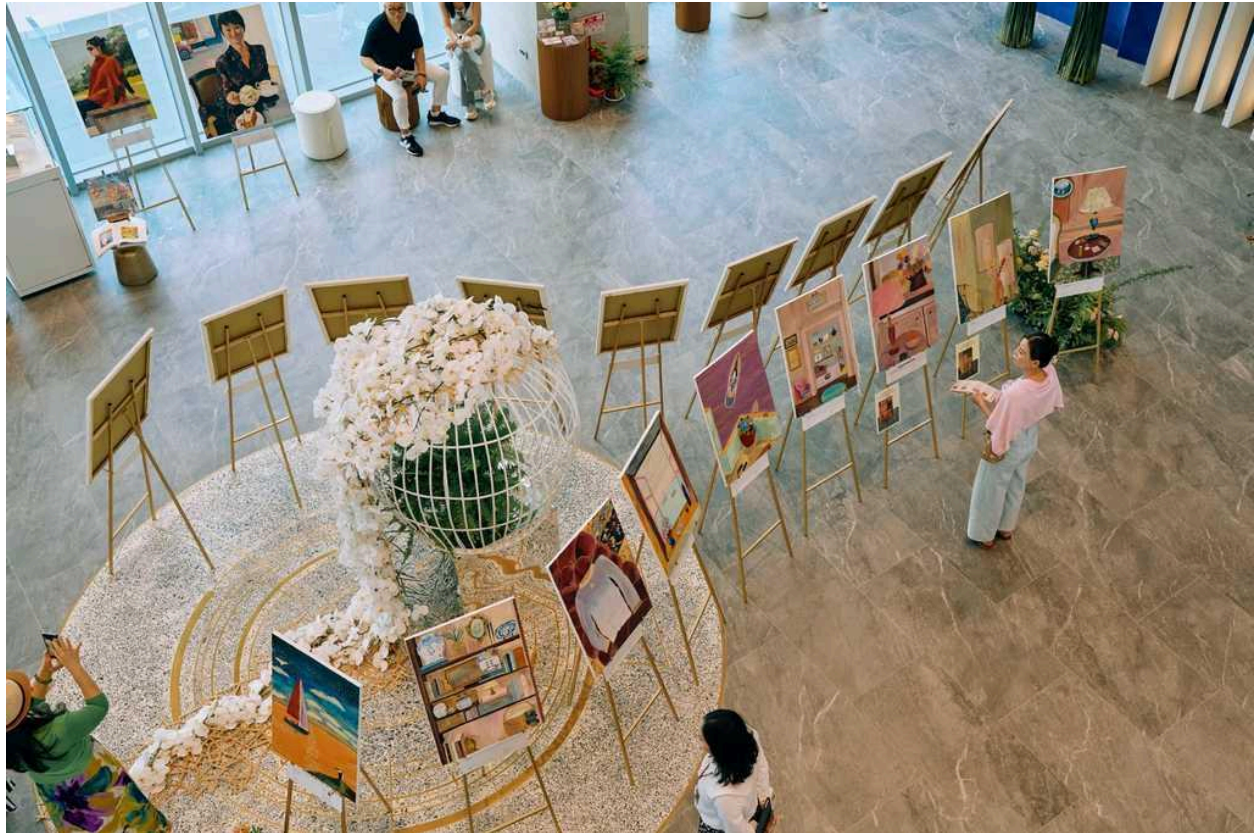
Joyce Ling's Glittering Yachting Art Exhibition in Tainan 2.