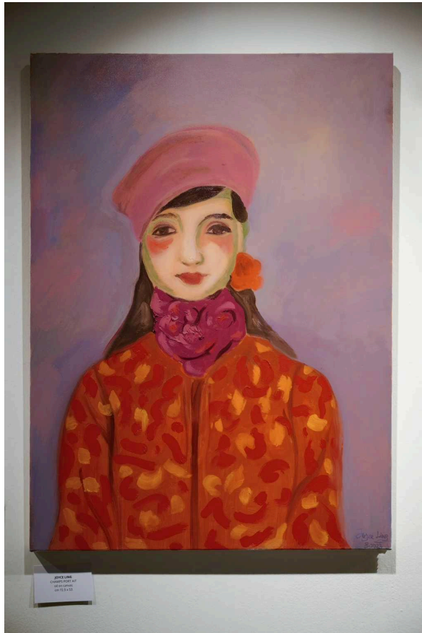
Exhibited artwork: Champs Self-portrait. Photo by Jia Daming. 展出畫作：香榭自畫像。圖/攝影師賈大明提供

因此今年10/22～28是她前行歐洲前的台灣唯一公開個展，將於台南亞果遊艇會的「丹琦·美術館」靜默展出7天，集結她在台灣創作、感動人心的代表畫作。一如Crocetti雕刻大師將歷史作品定錨於羅馬，凌丹琦也將她的歷程與視野，錨定於台灣、望眼世界，此處成為台灣私人美術館珍藏歷史作品的收藏處。