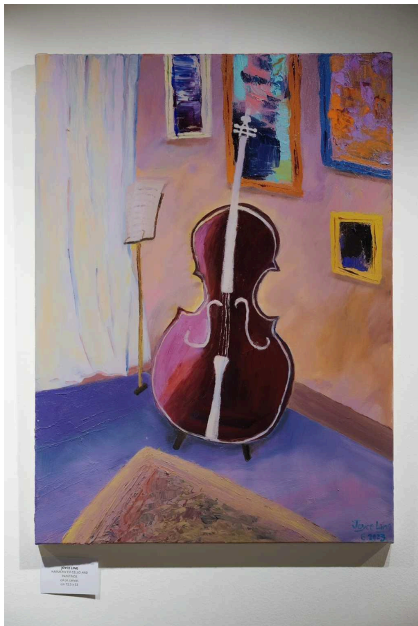
Exhibited artwork: Harmony of Cello and Paintings. 展出畫作：琴色合音。