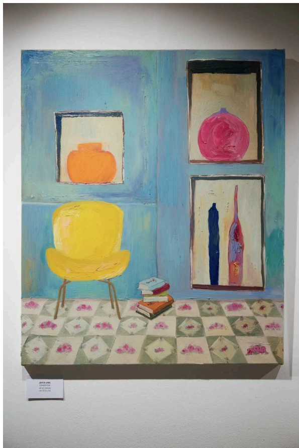
Exhibited artwork: Exhibition. 展出畫作：展。